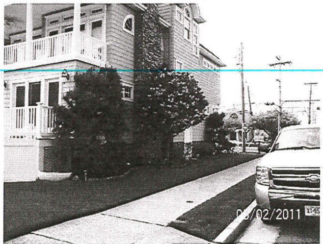
Left Side View – Date of Photograph: (See Photo Stamp)